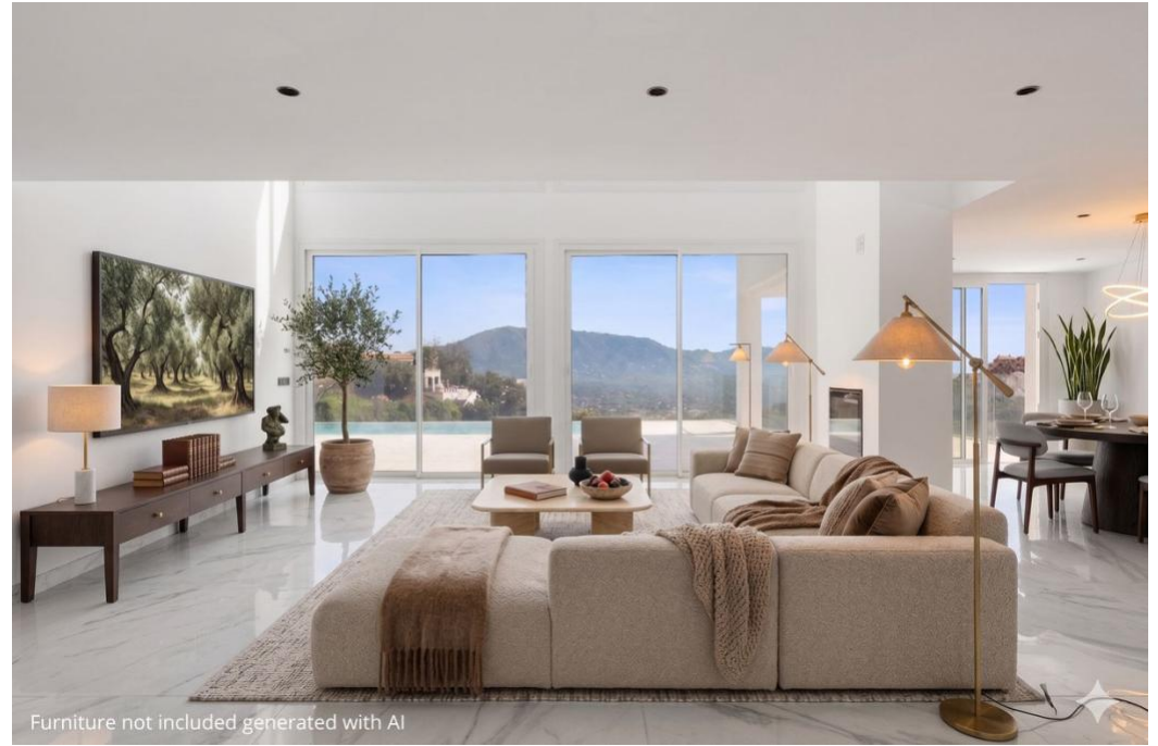
Furniture not included generated with AI